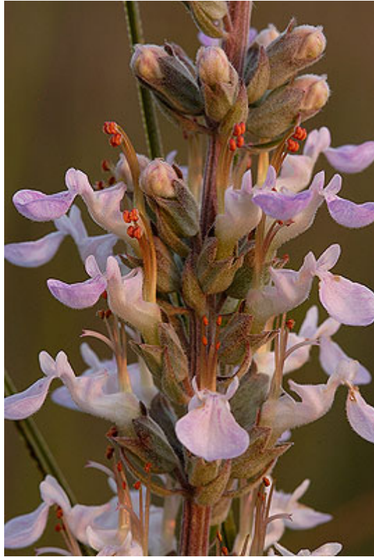
Wood Sage - Long Pine Key, Everglades National Park