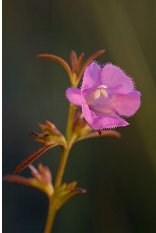
Unknown Flowers – Long Pine Key, Everglades National Park