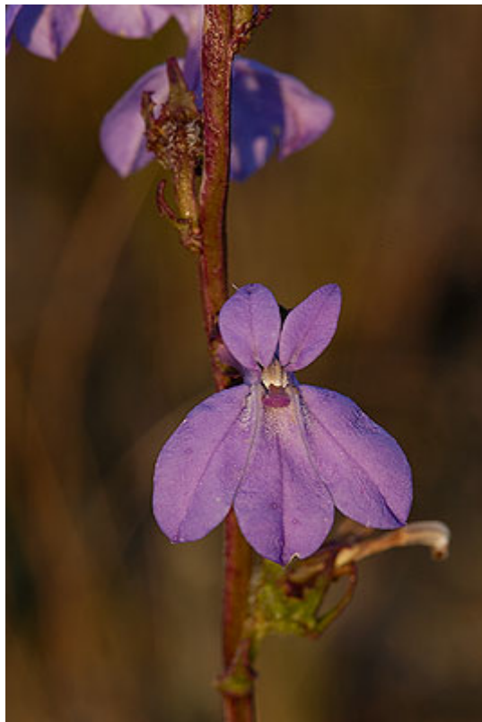
Glades Lobelia – Long Pine Key, Everglades National Park