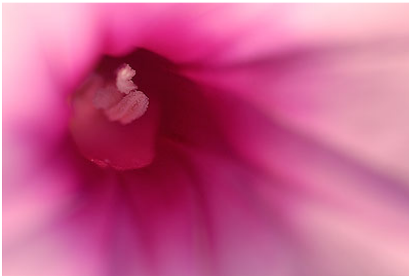
Unknown Morning Glory – Long Pine Key, Everglades National Park