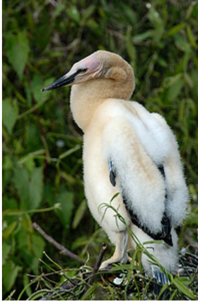
Anhinga Chick – Shark Valley, Everglades National Park

Thursday morning at Shark Valley was very productive as I was able to spend some time with these Anhinga chicks that are getting pretty old. With the normal chaos of the nest scene I was pleased to be able to isolate this chick as it stood away from the other two for a few minutes.