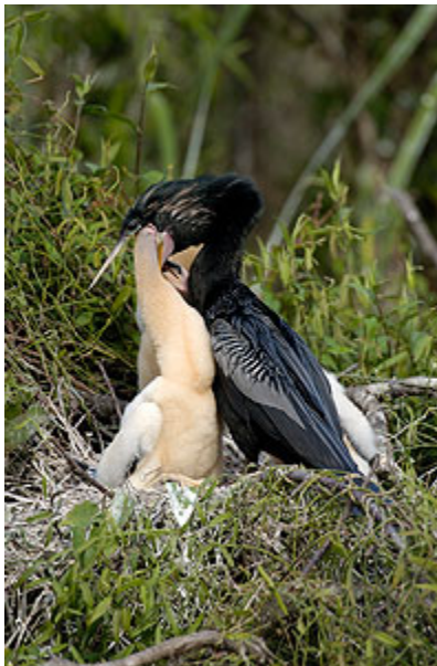
Anhinga Family – Shark Valley, Everglades National Park

Thursday morning at Shark Valley was very productive as I was able to spend some time with these Anhinga chicks that are getting pretty old. With the normal chaos of the nest scene I was pleased to be able to isolate this chick as it stood away from the other two for a few minutes.