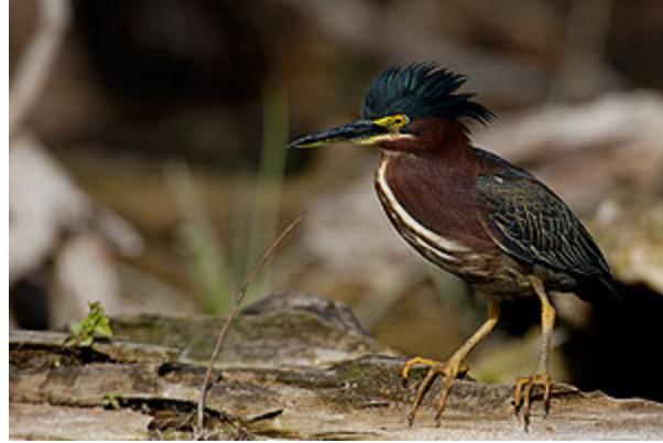
Green Heron – Turner River Road, Big Cypress National Preserve

I was able to work with this Green Heron for quite a while as it was fishing along a dead log. Most of the images are static portraits but the raised crest on this one really makes the image for me.