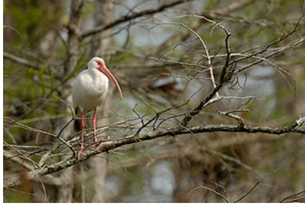
White Ibis in Cypress – Turner River Road, Big Cypress National Preserve

I really enjoy photographing White Ibis as they perch in the cypress trees throughout the swamps. There is a lot of clutter in this image but for me that shows the habitat where the ibis live. I have a similar image except an immature and on a branch with much more foliage. I will probably post it in the near future.