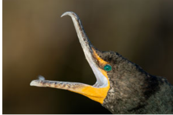
The Yawn (Double-crested Cormorant) – Anhinga Trail, Everglades National Park

After fishing the cormorants perch on the railing to rest and are oblivious to the people walking by. I was focusing on the emerald eye and trying to capture a portrait when this bird yawned allowing me to capture one frame mid yawn.