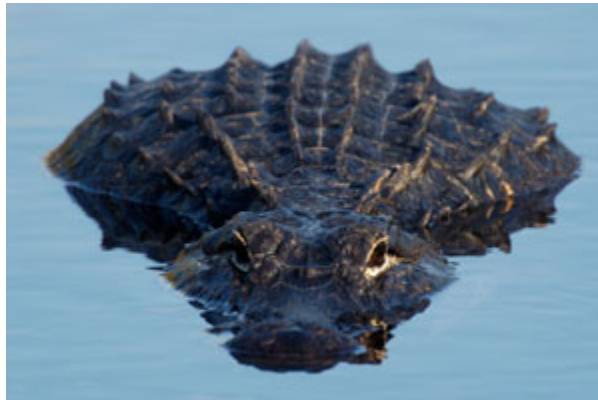
American Alligator – Anhinga Trail, Everglades National Park