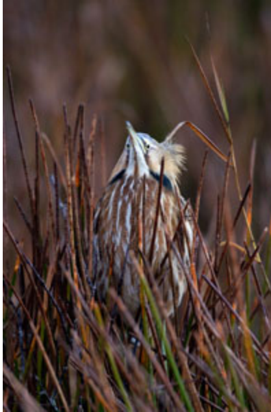
American Bittern – Anhinga Trail, Everglades National Park

During the evenings at Anhinga Trail the alligators become very active towards the back of the trail. As the reptiles prepare for the evening many of them swim out of the back marshes towards the boardwalk. I really like the head on perspective as it really accentuates the size and width of the gator.