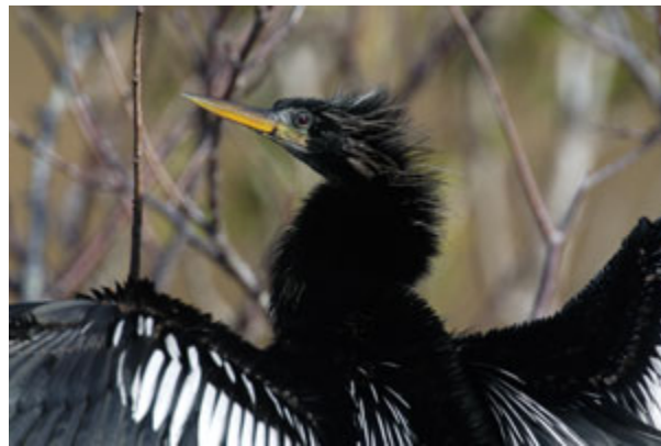
Male Anhinga – Anhinga Trail, Royal Palm, Everglades National Park

This is another image from the same bird as above. Here I have made a somewhat unconventional square crop to focus your attention on the fierce eyes and beak. This bird was extremely cooperative and allowed close approach from a large number of people. One woman even ventured within about 15 feet and the hawk never even reacted to her presence.