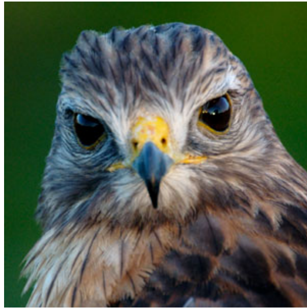
Red-shouldered Hawk Portrait – Eco Pond, Flamingo

“bird-on-a-stick” method. Here, the goal is to eliminate all distractions such as a busy background or other items in order to isolate the bird and simply show feather details and patterns. This and the next images are examples of this method.