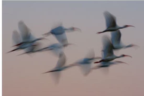
White Ibis in flight – Eco Pond, Flamingo

This shot is more of an experiment and a risk for me, but one that I am very pleased with. With the light dropping I decided to show the motion of flight by blurring the Ibis as they left the island to go roost in Florida Bay. To me, the soft colors of the sky, coupled with the motion, make this a pleasing shot. However, what makes this image possible is that despite being blurred, individual birds are easily distinguished and your mind isn't left trying to figure out what you are looking at.